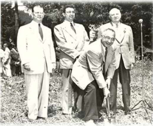
Groundbreaking for new Temple ~ July 1952