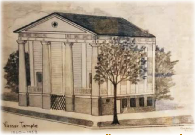
Vassar & Mill Streets Temple