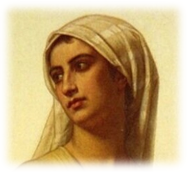
March 8: Ruth—a short story about love, loyalty and loving kindness

March 15: Job—the biblical writers' answer to the eternal question: why do bad things happen to good people?