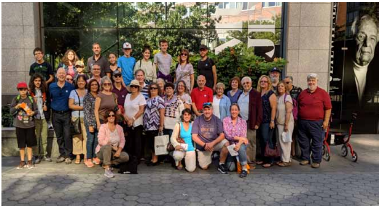
The participants in the VT trip to the Museum of Jewish Heritage in NYC on September 15 th