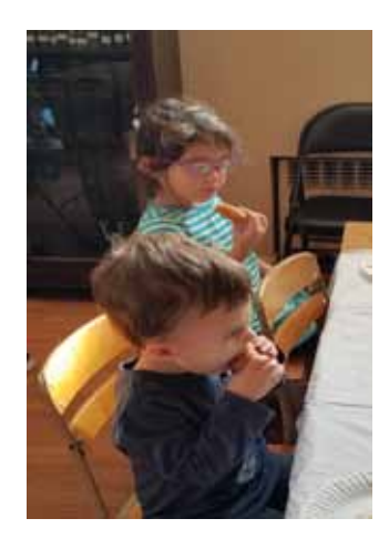
Religious School students working on projects