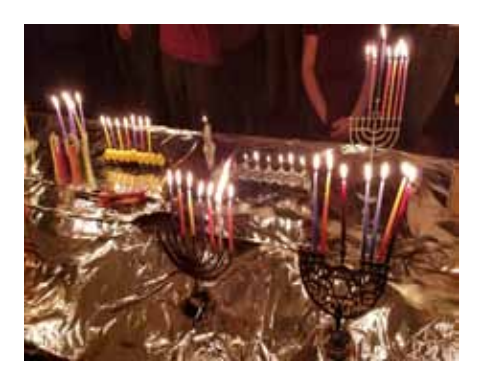
Glowing menorahs during Hanukkah service on December 7