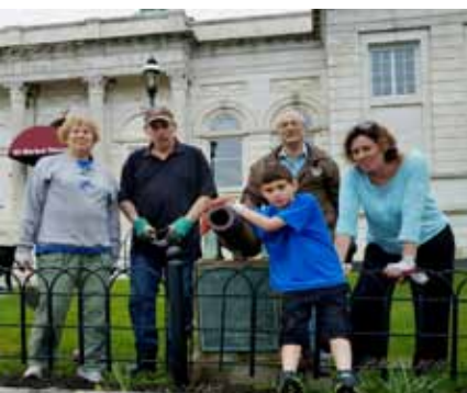
Vassar Temple members lending a hand on Mitzvah Day!