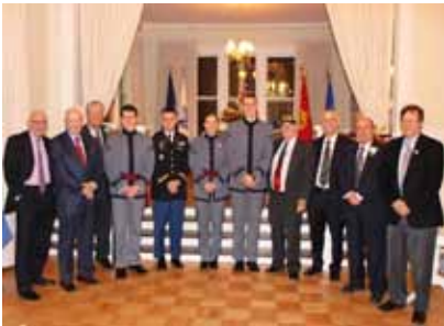
West Point Cadets with member veterans of military service at the Vassar Temple Gala