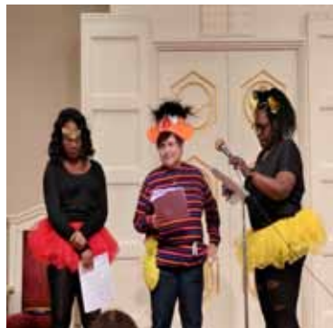
VT actors present the Purim Sesame Street Show