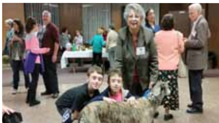
Shabbat Noach 2015

Pre-payment is requested. To be certain we have enough food available, please RSVP for the dinner to lbrundage001@gmail.com by Monday Oct. 31 st .