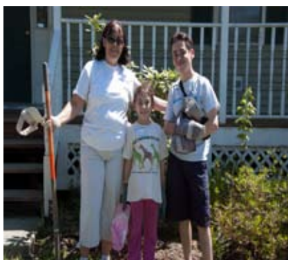
Mitzvah Day Activities

The suggested donation is $10; children under 12 are free. All proceeds will help the Dutchess County Interfaith Council continue its mission of 40 years of promoting understanding and respectful relationships among the diverse religious communities of our county. This event is always uplifting, so plan to attend!