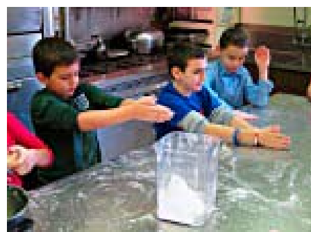
The third grade baked challah.